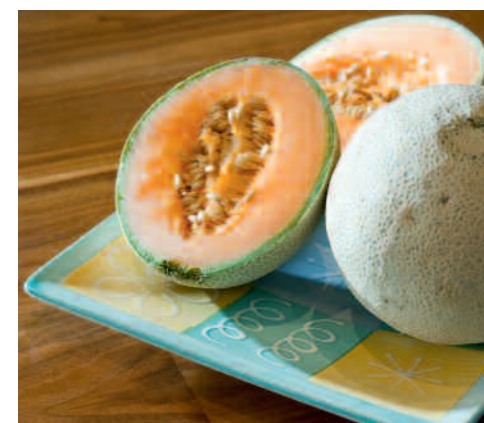
left & below Adding a rich walnut surface to pale cabinetry brings a sense of warmth and character.